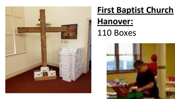
First Baptist Hanover