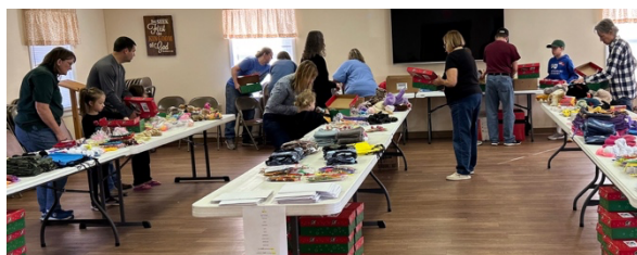
Greencastle Baptist Church

Central Baptist Church (Mont Alto): 65 boxes Chambersburg Baptist: 30 boxes Country and Town Baptist: 111 boxes Family of God: 106 boxes First Baptist Church Hanover: 150 boxes Greencastle Baptist Church: 160 boxes Mason Dixon Baptist (New Freedom): 168 boxes Stewartstown Baptist: 64 boxes Thompstontown Baptist : 380 boxes