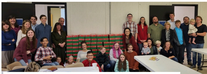
Mason Dixon Baptist Church